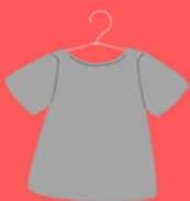
HANG SHIRT ON WIRE HANGER (MAKE SURE TO HANG CLOTHING WITH HANGER FACING THE CORRECT DIRECTION)