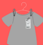
ATTACH TAG ON RIGHT SIDE OF SHIRT (RIGHT SIDE OF THE SHIRT WHEN YOU ARE LOOKING AT THE FRONT OF IT)