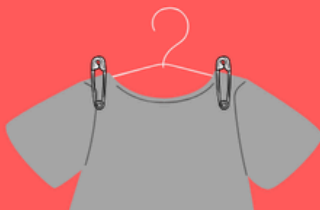
SAFETY PIN CLOTHING ONTO THE HANGER